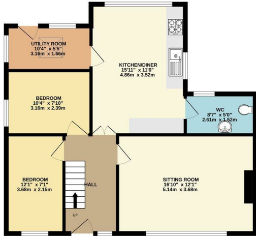
GROUND FLOOR 728 sq.ft. (67.6 sq.m.) approx.